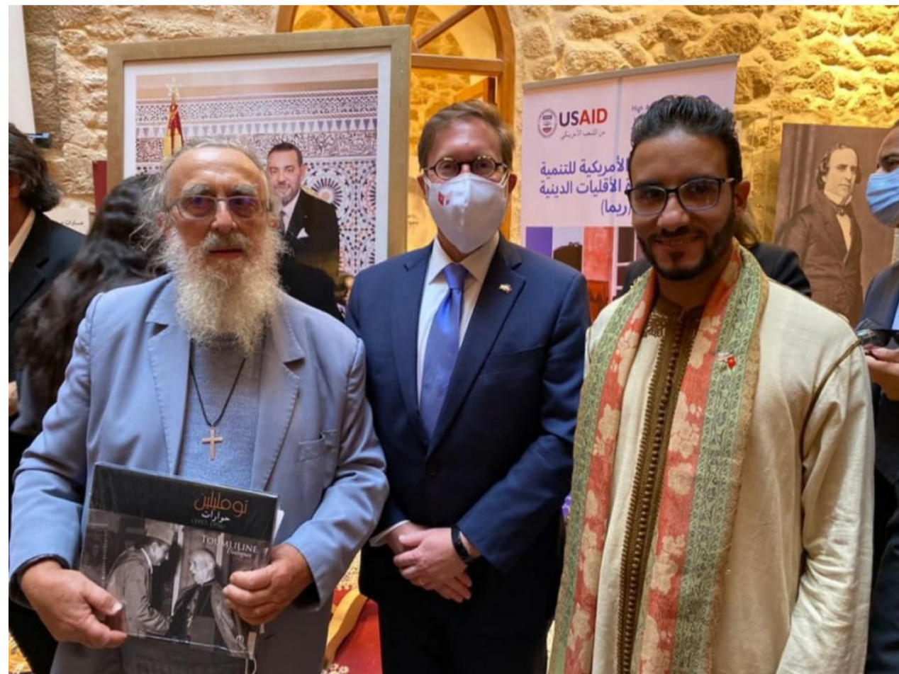
The diplomats met in Bayt Dakira ( the House of Memory) located in Mellah, the Jewish quarter of Essaouira.